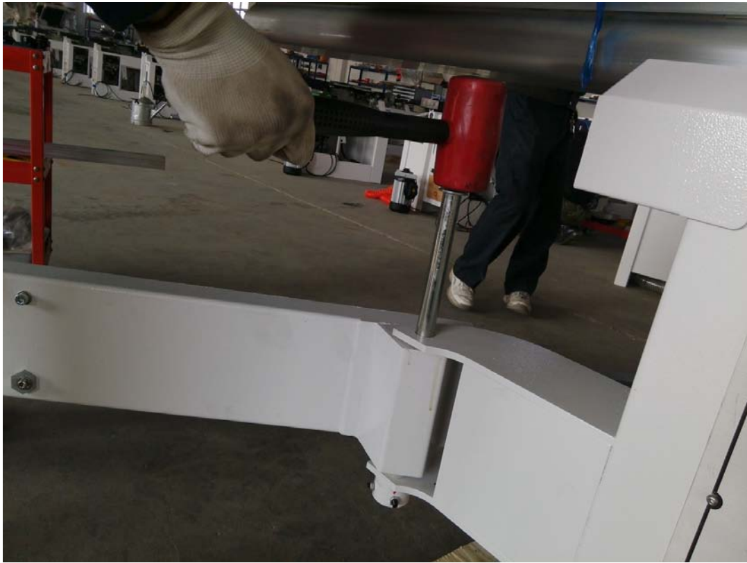
3- Fix the universal foot on the spindle