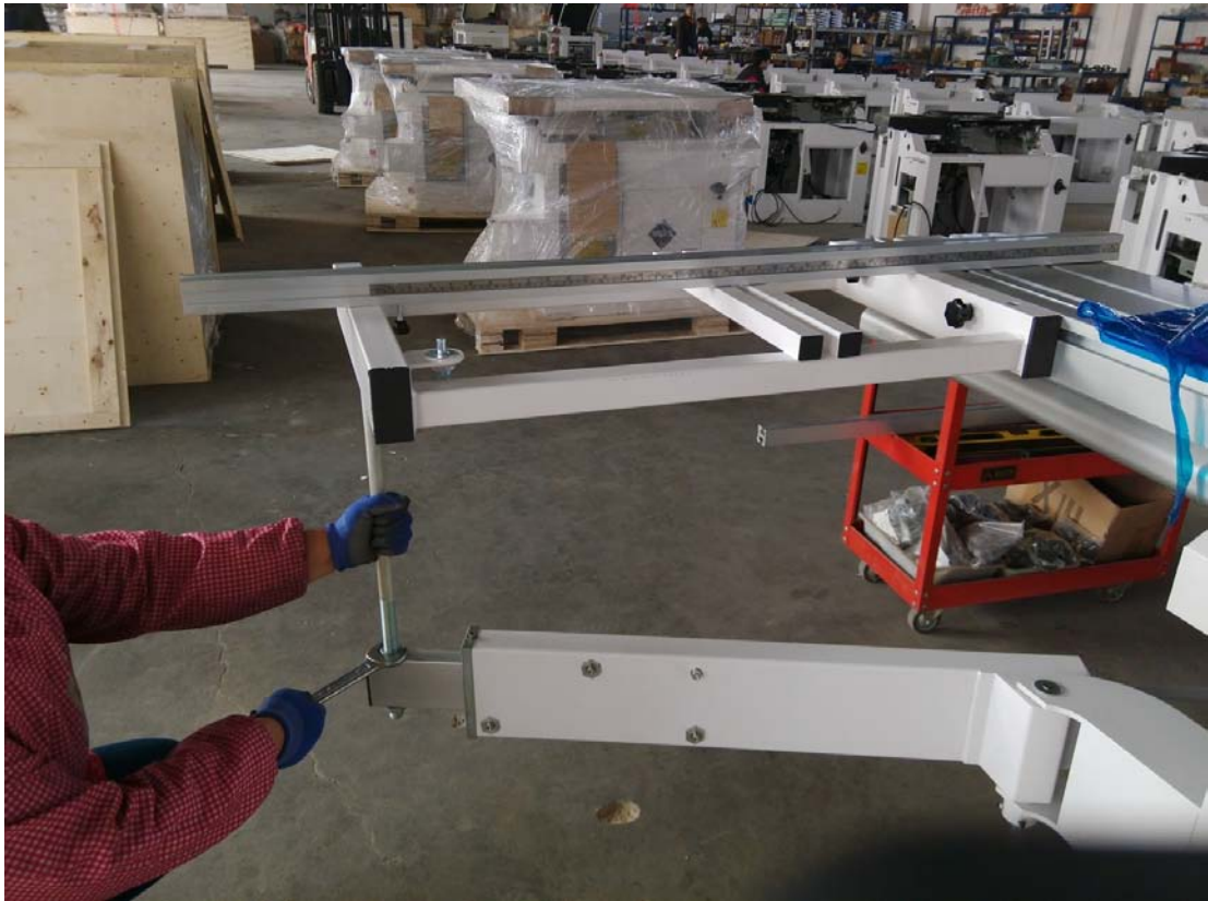
7- Assemble the guiding ruler